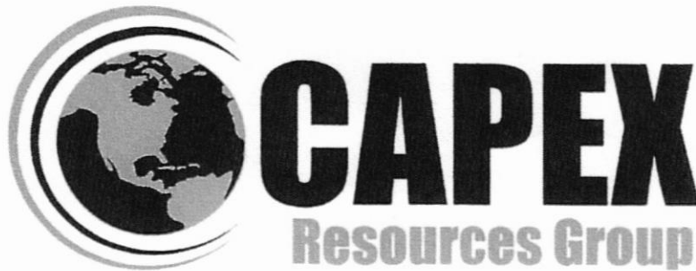
EXHIBIT tabbles 6